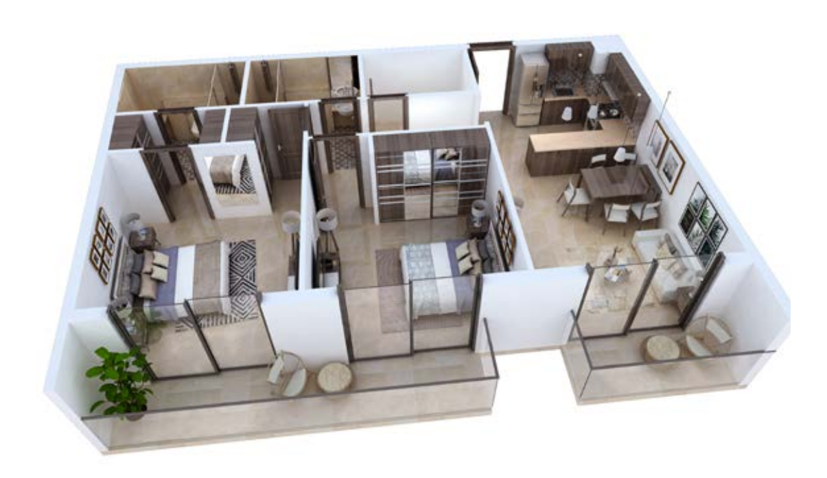
TYPICAL 2 BEDROOM APARTMENT